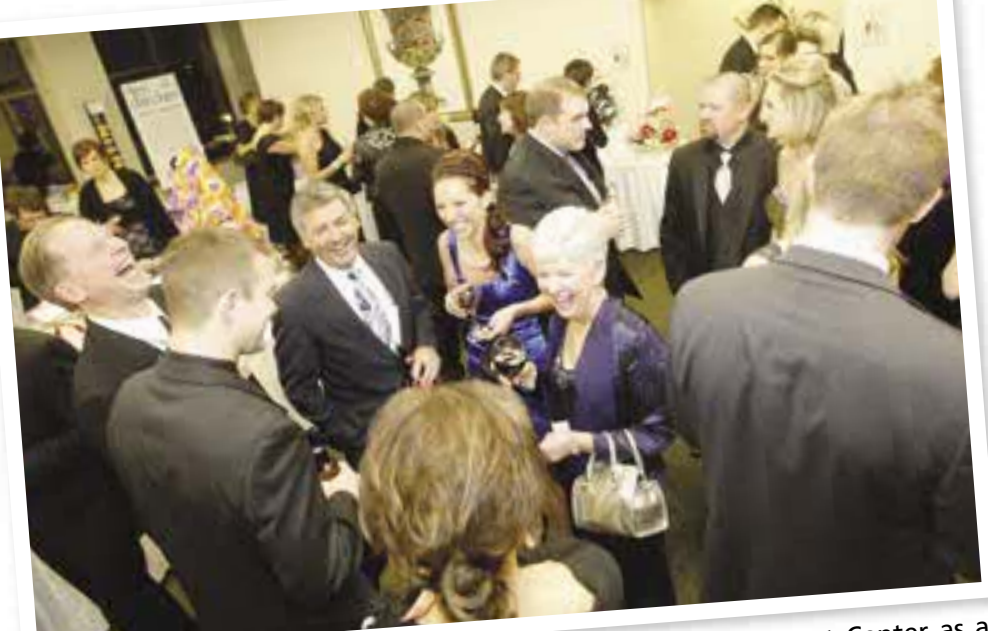
It was a jam-packed lobby at the Rochester International Event Center as attendees catch up with old friends and make new ones and browse the many silent auction items.