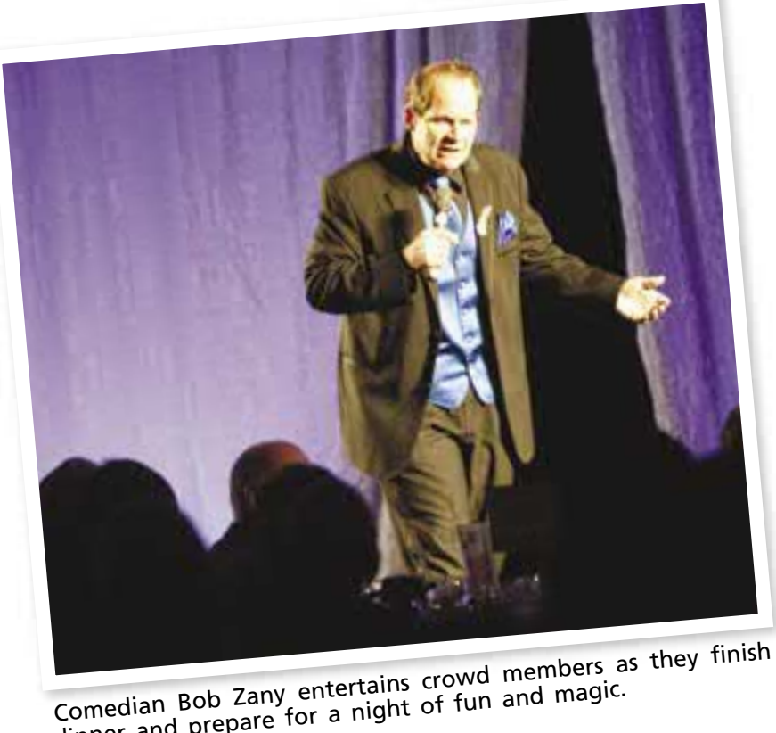
dinner and prepare for a night of fun and magic.

On Feb. 28, we'll feature the annual fundraiser for Rochester Montessori School.