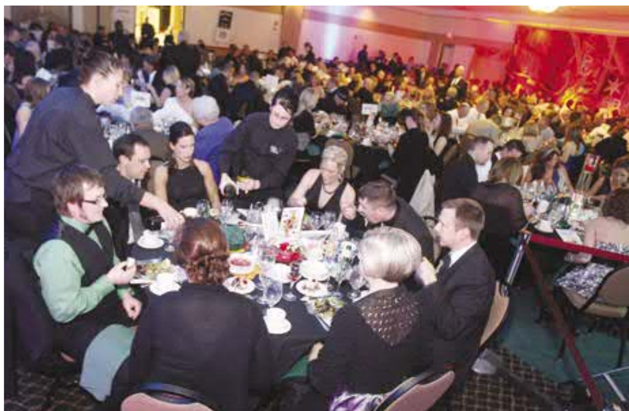
Guests are seated for dinner at the Rochester International Event Center. The room was transformed to a Las Vegas feel for the evening.