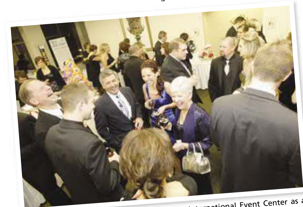
It was a jam-packed lobby at the Rochester International Event Center as attendees catch up with old friends and make new ones and browse the many silent auction items.